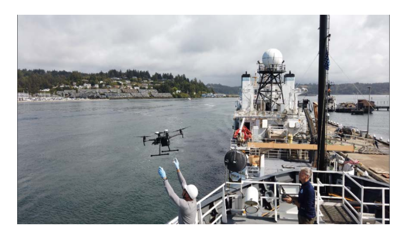
Hand catching the DJI M210 on the NOAA Ship Shimada.

Multiple M210RTK flights were conducted from the NOAA Marine Operations Center pier in Newport, OR and from the decks of the NOAA Ships Shimada and Hi'ialakai. Both hand launches and recoveries were successfully completed from the two ships at multiple deck locations. Protocols and procedures were tested and modified to eliminate any magnetic interference or initialization issues and ensure safe operations.