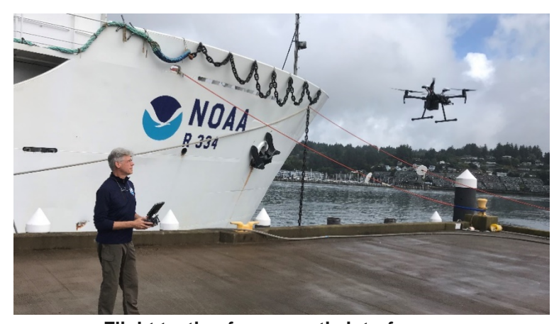
Flight testing for magnetic interference.

This project builds upon recent successful UAS operations aboard NOAA Ship Thomas Jefferson with the OCS Coast Survey Development Lab Hydrographic Systems and Technology Branch which demonstrated the potential for ship and small boat-based UAS operations in support of NOAA charting and emergency response requirements.