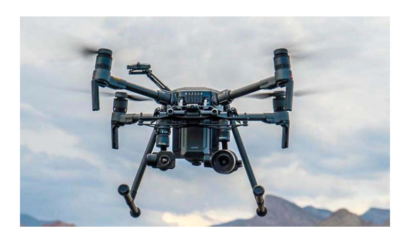
UAS Description – DJI Matrice 210.

The anticipated advantages of incorporating the M210RTK into the NOS Coastal Mapping and Nautical Charting missions include increased productivity without an associated increase in cost, reduced risk to people and Government property and improved data quality. With the potential to reduce charting backlog, the addition of the M210RTK operated in conjunction with ship and launch data acquisition strategies allows surveys to be completed in less time than only traditional survey methods.