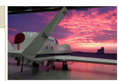
NASA's Global Hawk prepared for launch from NASA Wallops Flight Facility, VA in support of the NOAA-led SHOUT 2016 mission hurricane rapid response research flights.

The NOAA UAS program collaborated with the US Coast Guard during Arctic Shield 2013-15 missions to ensure the Arctic remains a safe, secure and environmentally protected resource. The Pumas UAS was hand launched from the US Coast Guard Cutter Healy north of Alaska and used to return imagery during a Search & Rescue Exercise simulating a man in the water. This mission complimented previous operational assessments monitoring ice, simulated oil spills and marine debris in the Arctic.