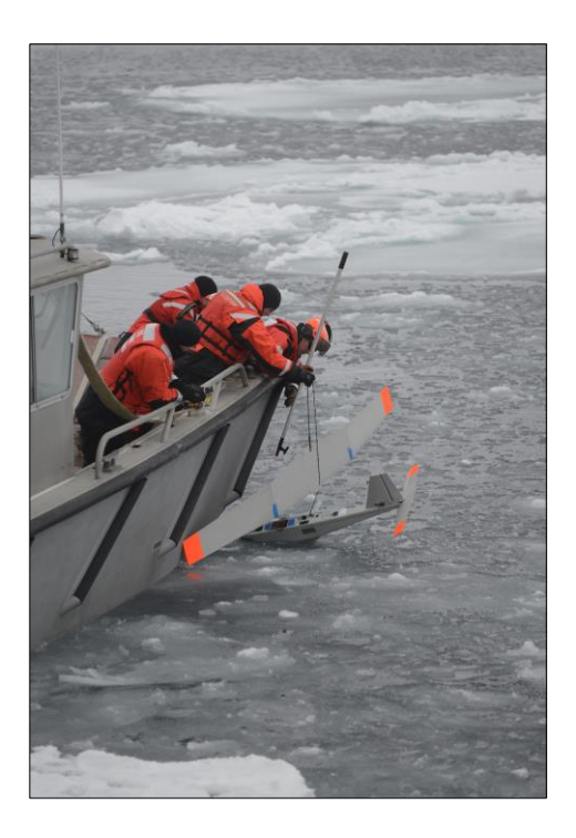
Figure 1. Boat recovery of Puma AE during Arctic Shield 2013.

As a result, one of the recommendations for future operations was to develop autonomous landing procedures for the Puma AE and to obtain the necessary permissions to continue to reduce personnel and equipment safety risks. This operation was recently successfully tested onboard the NOAA UAS R/V Shearwater. The system was successful during 10 perfect autonomous captures during this developmental testing (see Figure 2).