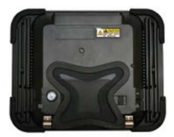
Figure 9. INMARSAT Hughes 9211-HDR.

The rugged and lightweight Hughes 9211-HDR is an affordable High Data Rate terminal, ideal for media, governments, NGOs, mobile healthcare providers and possibly for shipboard operations in the Polar regions. The 9211-HDR has a hardened and compact design— currently the world's smallest and lightest HDR-capable BGAN. Users can connect at streaming broadband speeds of over 650 kbps with features such as built-in, multi-user WiFi access.