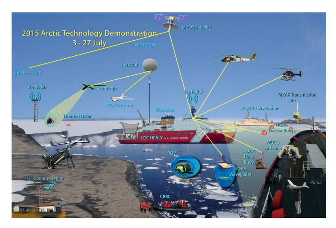
Figure 3. Arctic Shield 2015 SAREX Concept of Operations.