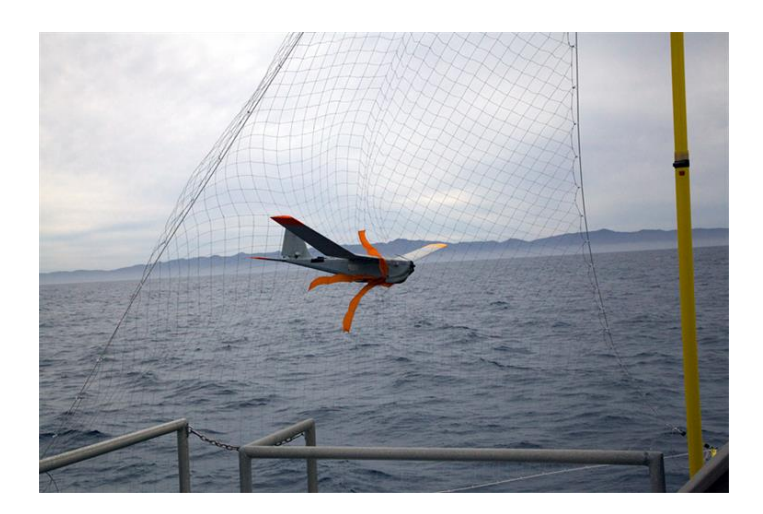
Figure 2. Autonomous net recovery of Puma AE in 2015 on NOAA R/V Shearwater.

As a result, one of the recommendations for future operations was to develop autonomous landing procedures for the Puma AE and to obtain the necessary permissions to continue to reduce personnel and equipment safety risks. This operation was recently successfully tested onboard the NOAA UAS R/V Shearwater. The system was successful during 10 perfect autonomous captures during this developmental testing (see Figure 2).