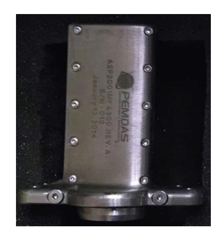
Figure 8. PEMDAS ASAP Metrological & Icing Sensor.