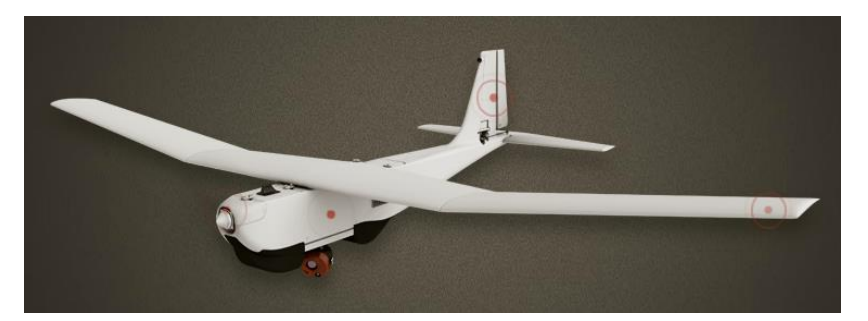
Figure 4. Puma AE.

durable with a reinforce fuselage construction. It is man portable for ease of mobility and requires to auxiliary equipment for launch or recovery operations.