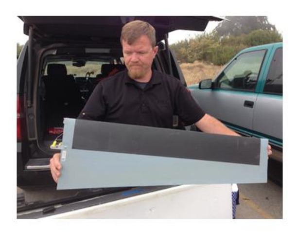
Figure 7. Nano-tube integrated onto airfoil leading edge.

tested onboard the Puma AE to mitigate icing hazards. This will be the first shipboard anti-/de-icing testing for small UASs.