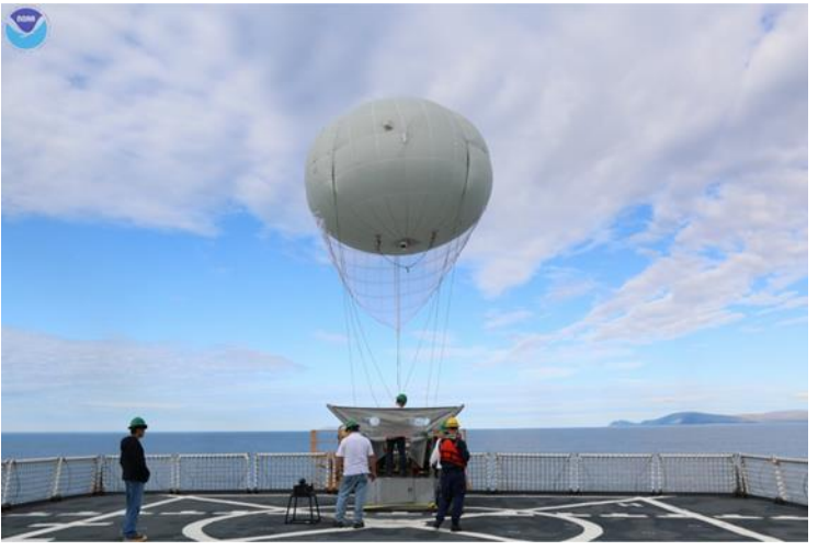
Figure 5. IGM Aerostat onboard USCGC Healy 2014.

Inland-Gulf Maritime LLC (IGM) was selected to participate in the Arctic Shield 2014 and will rejoin our team for this year's OA. The IGM Aerostat-IC was deployed to support the USCG during the oil spill response exercise which was held on Lake Michigan in February 2013. The system provided the USCG with aerial video of the various exercises and proved to be a great asset during a man overboard exercise using the IR capability. As a follow on, the Aerostat-IC deployed on the USCG Healy for Arctic Shield 2014 Technology and Arctic Oil Spill Evaluation. The system was tested for its capability to support both oil spill tracking and other emergency response scenarios in arctic conditions which proved the value of utilizing an Aerostat for remote surveillance during an oil spill scenario. The team provided an aerial view both in EO and IR to prove the value to the operators to receive an overview of operating situation to enable work crews to attack the heaviest oil and increase encounter rate so that the oil spill can be efficiently and effectively cleaned up. This video can also be transmitted to a command center to enable pre-planning for the NOP. Arctic Shield 2015 will further assess this technology with advance payloads in support of ISR, MDA and SAR missions.