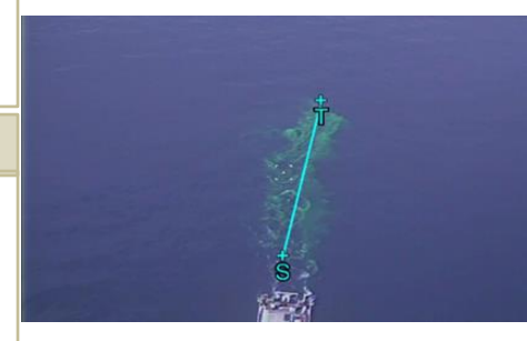
Imagery from the Puma UAS showing fluorescein dye used to simulate a potential oil spill.

The NOAA UAS program collaborated with the US Coast Guard during the recent Arctic Shield 2013-15 missions to ensure the Arctic remains a safe, secure and environmentally protected resource to test the use of a 13-pound Puma UAS in responding to potential future oil spills in the Arctic. Pumas were hand launched from the US Coast Guard Cutter Healy north of Alaska and used to return imagery of simulated oil on the water. With increased oil exploration and drilling in the Arctic, rapid response to oil spill and SAR events will be critical. The Puma has the capability to immediately see the size and potential impact of an oil spill event. This mission complimented work monitoring simulated oil spills in other regions including the Channel Islands and more flights were executed in the Summer of 2015 in the Arctic.