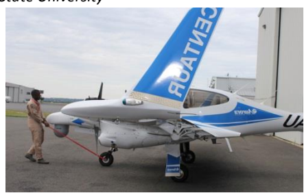
The Aurora Flight Sciences Centaur Optionally Piloted Aircraft will be tested for gravity sampling missions with SBIR funding.

Map of the Pearl River Basin in Mississippi collected using the Altavian UAS on September 23, 2014.