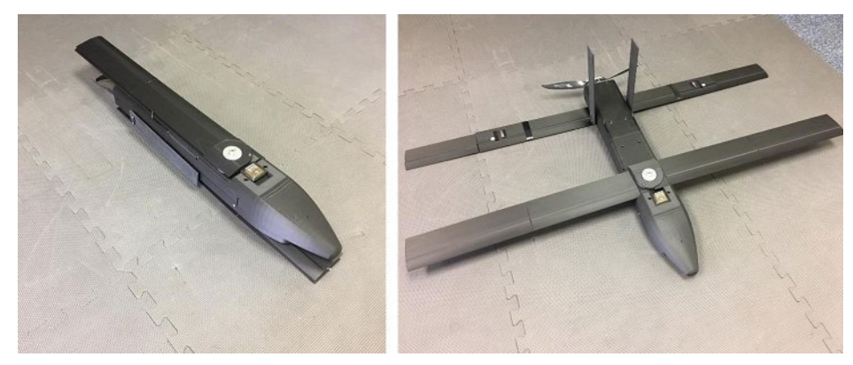
Barron Associates Wingsonde Air-Deployable sUAS.

This effort is important because, though the interaction between the ocean and hurricanes is important and complex, current ocean observing methods are limited in their ability to fully understand this relationship. Hurricanes depend on the ocean to supply the necessary heat and moisture to form and maintain the system. The detailed process by which a storm draws heat from the ocean and ultimately converts it into kinetic energy (i.e. strong winds) is very complex and is currently not well understood. This lack of understanding is primarily due to the limited availability of detailed observations within the storm in the boundary laver. The amount of heat and moisture extracted from the ocean is a function of wind speed, ocean temperature, atmospheric temperature, pressure and humidity. Accurate measurements of these variables are needed, yet exceedingly difficult to obtain due to the severe weather conditions that exist at the ocean surface during a hurricane. A limited array of surface buoys make insitu measurements in the boundary layer spotty, while direct measurements at very low altitudes using NOAA and Air Force hurricane hunter manned aircraft is impossible due to the severe safety risks involved. Nevertheless, for scientists to dramatically improve our understanding of this rarely observed region, detailed, continuous observations must be obtained.